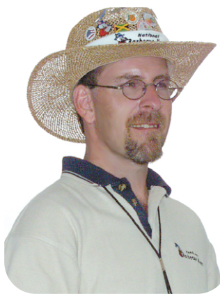
The paper continues to grow and prosper today under the watchful eye of Kell Phelps, who purchased the paper in 2003.

Note: Our beloved co-founder, "Doc" Gillis, passed away in October 2005.